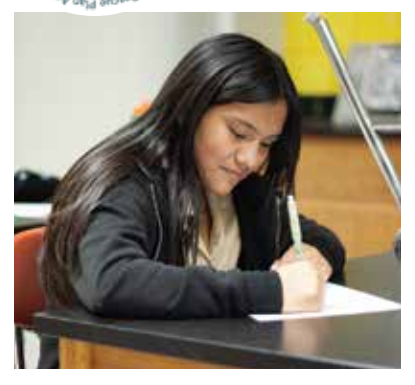
Ignite Afterschool supports a variety of programs for Rice County youth